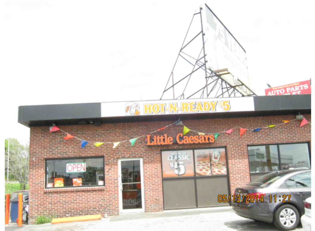
( http://images.vgsi.com/photos2/BridgeportCTPhotos//\00\10\ )