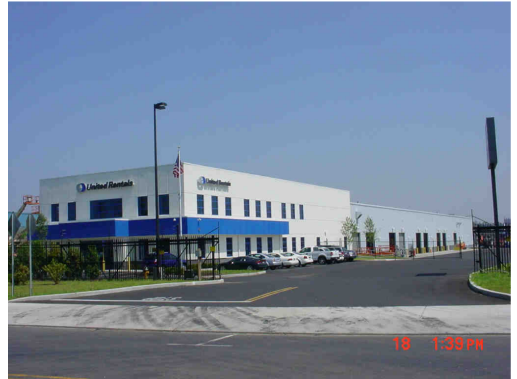
( http://images.vgsi.com/photos2/BridgeportCTPhotos//\00\09\ )